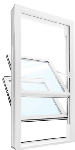
Tilt in sash option, with both sashes sliding