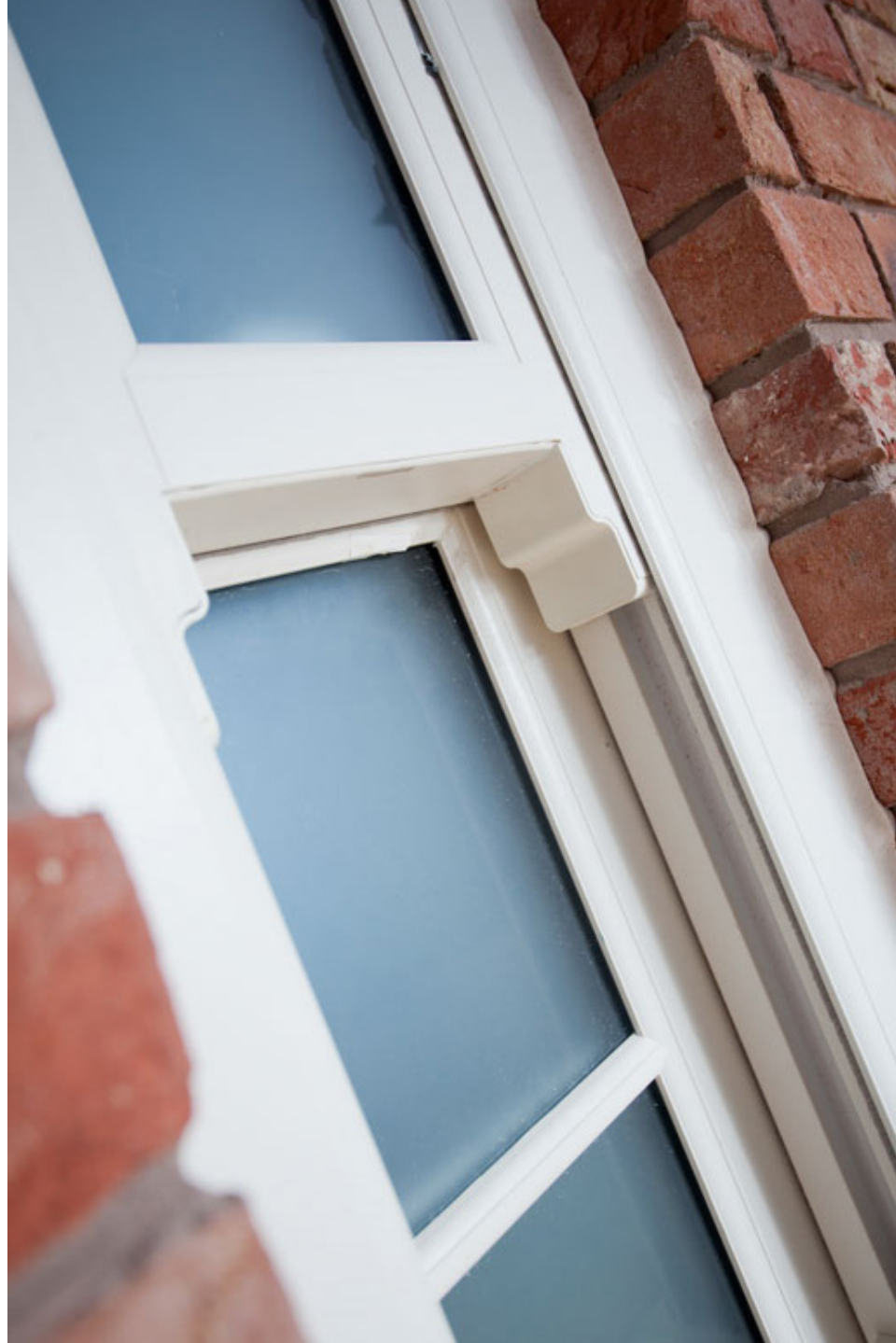
Run through sash horn