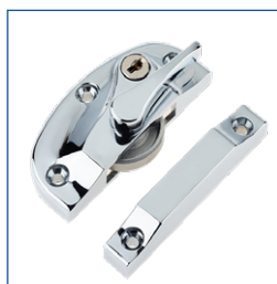
Sash Lock and Keep