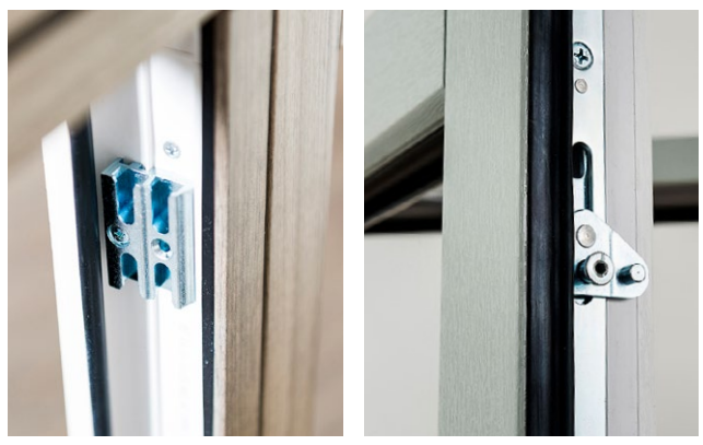
Locking mechanism securing all four sides of the opening sash.

Each window will feature a multi-point locking system, securing all four sides of the opening sash, for your safety and security.