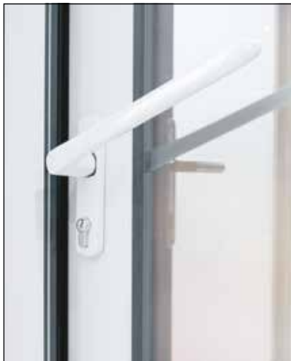
Handle available in White, Black or Anodised Silver