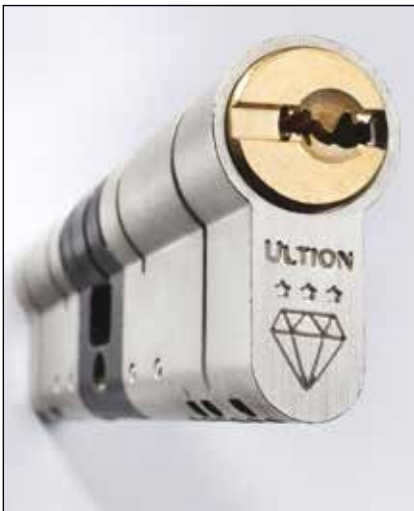
Ultion Cylinder lock, tested against all known methods of break-in