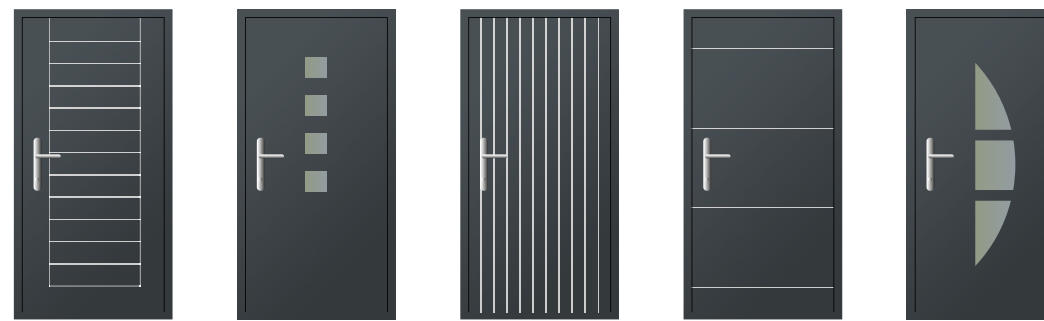
KS70-003 KS70-010 KS70-015 KS70-021 KS70-095